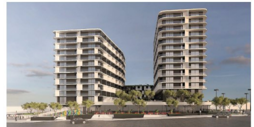
Streetview looking north from Baseline Road

for independent retirement living, and the easterly tower intended for a retirement lifestyle requiring a higher level of personal care and service. 15 storeys is the maximum height allowed and does not require a zoning amendment. Included in the plan are 400 residential units with 333 total parking spaces, mostly below grade.