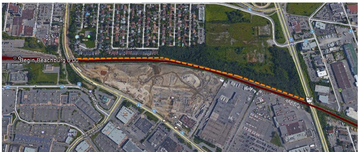
Figure 1: Alta Vista area vegetation control

As such, VIA Rail Canada and its contractors will perform vegetation control in our right of way to eliminate hazardous brush and weeds in the areas indicated on the maps below. This notice is to inform citizens of the upcoming work, specifically along railway adjacent to residences on Ramsgate Private, Marble Crescent, Springland Drive, Cromwell Drive, Colman Street, Avenue O and Avenue P and possibly Flannery Drive.