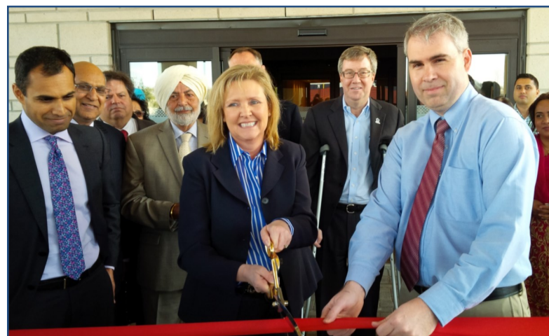
Councillor Brockington on hand to help open the new Hampton Inn in the Hunt Club neighbourhood, joined by Mayor Jim Watson and Councillor Diane Deans.

A major long-term concern is to maintain our portions of Hunt Club Road and Riverside Drive as efficient, reliable arterials in order to protect our living areas from cut-through traffic and to