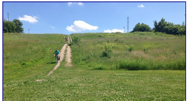
Cyclists riding down Carlington Hill in its current form.