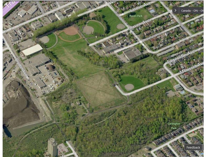
Aerial view of Carlington Park's hill and ball diamonds