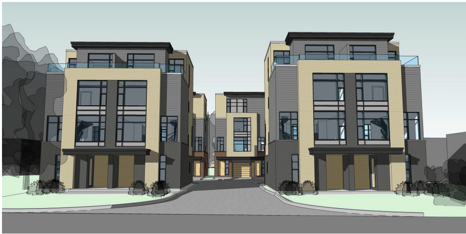
Artist’s rendering of the proposed development at 1110 Fisher Avenue