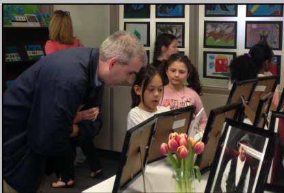
Visiting Artrageous and getting a tour of the art. Artrageous is held annually at St. Elizabeth School in Carlington each May. Students create artwork themselves and then sell all of it back to the community.