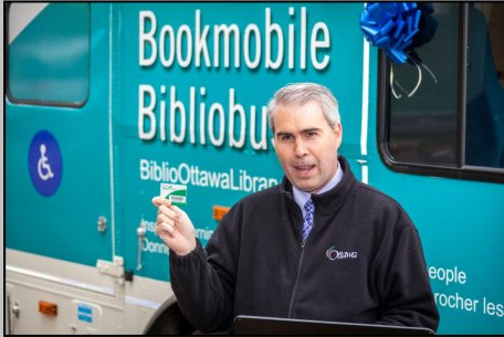
Showing off my library card at the launch of the new bookmobile on Caldwell Avenue. (October 2016)