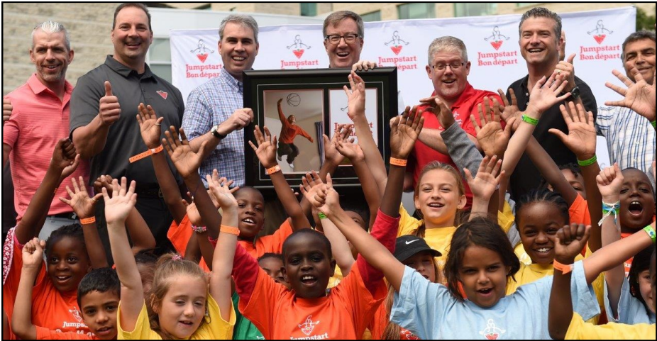
The children from the Caldwell Jumpstart program joined me at City Hall for the Canadian Tire jumpstart program kick-off July 19, 2016.