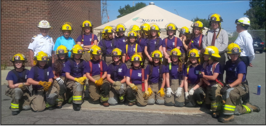
With the graduating class of Camp FITT (Female Firefighters in Training), aimed at encouraging young women to consider a career in fire fighting. (August 2016)