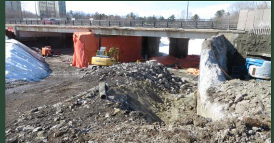
Phase 1(a) construction