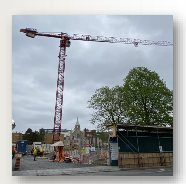
Contruction site for 811 Gladstone for 140 new units (also known as Rochester Heights Phase 1)