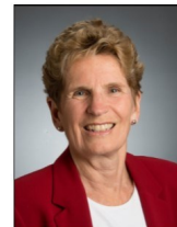
Kathleen Wynne Ontario Provincial Parliament, Don Valley West Former Premier of Ontario